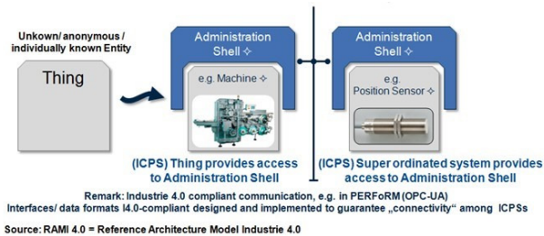
Figure 3: Industrie 4.0 component is an ICPS-component.

components into ICPS-components, i.e., I4.0-components, as briefly described in Figure 3, using the architectural rules addressed by the Reference Architectural Model Industrie 4.0 (RAMI4.0) [24]. In this perspective, robots and machinery became Industrie 4.0 ICPS components comprising the "Thing" itself and the "Administration Shell".